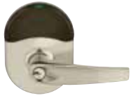
619 - Satin nickel

Standard cylinders shown, SFIC and FSIC also available.