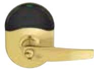
606 - Satin brass