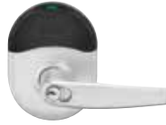
626AM - Satin chrome with antimicrobial