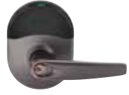
643e - Aged bronze