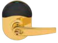
605 - Bright brass