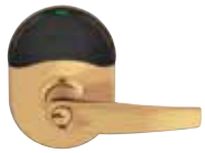
612 - Satin bronze