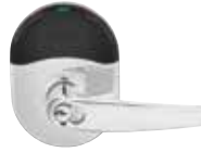
625 - Bright chrome