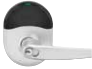
626 - Satin chrome